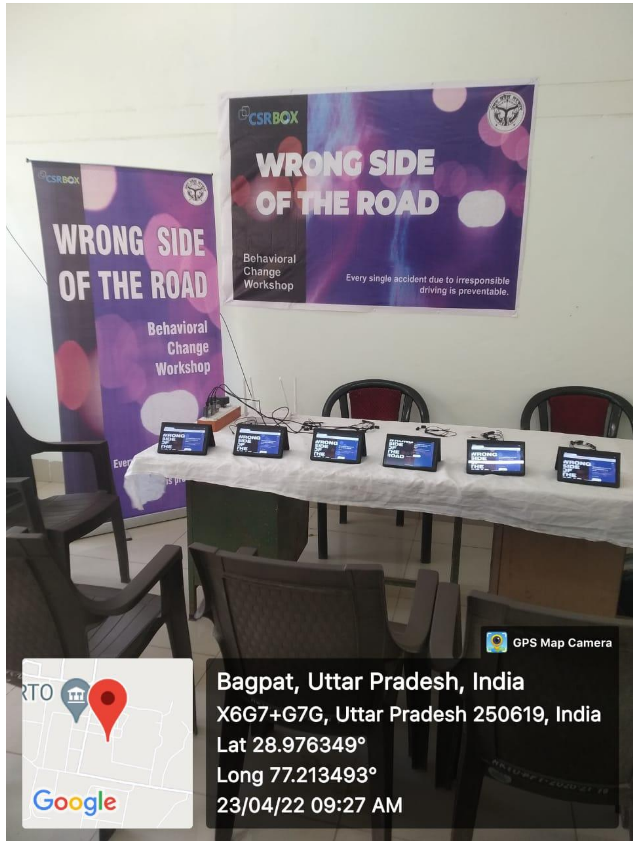
Tab Lab setup by Wrong Side of the Road and CSRBOX team in Uttar Pradesh